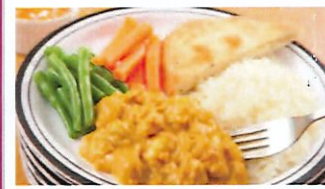
Chicken Korma served with Rice, Naan Bread & Seasonal Vegetables