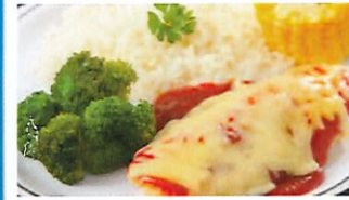
BBQ Chicken served with Savoury Rice and Seasonal Vegetables