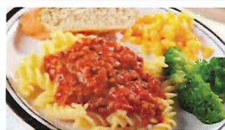
Pasta Bolognese served with Garlic & Herb Bread and Seasonal Vegetables