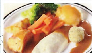
Roast Chicken served with Roast/Mashed Potatoes, Seasonal Vegetables & Gravy