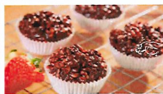
Chocolate Crispy Cake