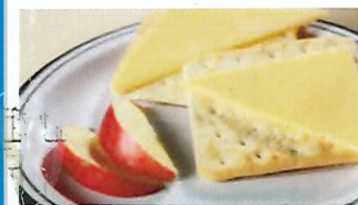
Cheese & Crackers