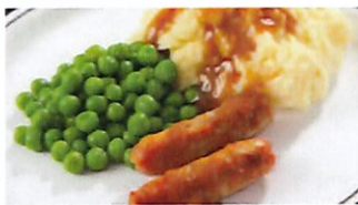
Sausages served with Mashed Potato, Seasonal Vegetables & Gravy