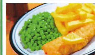
Battered Fish (MSC) served with Chips & Peas or Baked Beans

VEGETARIAN VERSIONS OF THE ABOVE MEAL AVAILABLE DAILY