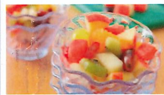
Fresh Fruit Salad