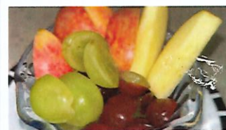
Apple & Grape Pot