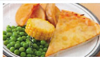
Cheese & Tomato Pizza, served with Potato Wedges & Seasonal Vegetables