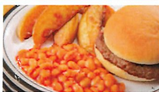
Beef Burger served in a Bun with Potato Wedges & Seasonal Vegetables or Baked Beans