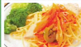
Sweet Chilli Chicken served with Noodles & Seasonal Vegetables