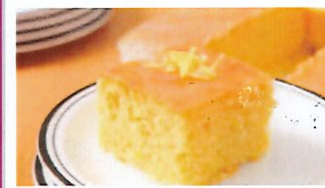
Lemon Drizzle Cake