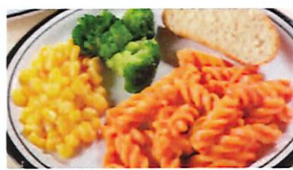
Tomato & Mascarpone Cheese Pasta served with Garlic & Herb Bread and Seasonal Vegetables