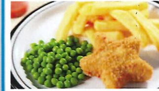
Fish Star (MSC) served with Chips & Peas or Baked Beans

VEGETARIAN VERSIONS OF THE ABOVE MEAL AVAILABLE DAILY