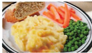
Mac 'n' Cheese served with Garlic & Herb Bread and Seasonal Vegetables