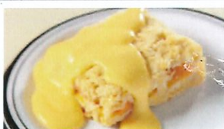
Peach Crumble Slice & Custard