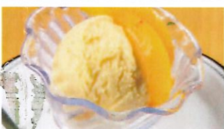
Ice Cream & Fruit